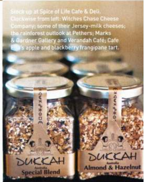
Stock up at Spice of Life Cafe & Deli. Clockwise from left: Witches Chase Cheese Company; some of their Jersey-milk cheeses; the rainforest outlook at Pethers; Marks & Gardner Gallery and Verandah Café; Cafe Etti's apple and blackberry frangipane tart.