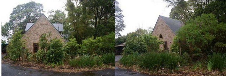
(Entry to Witches Falls)