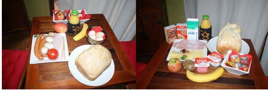
Our meals during our stay!