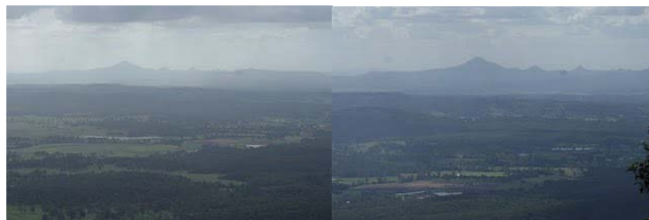
(Left - the view - somewhat distorted by the rain but just beautiful anyway! Visit the look out! & Right... on a slightly clearer day!