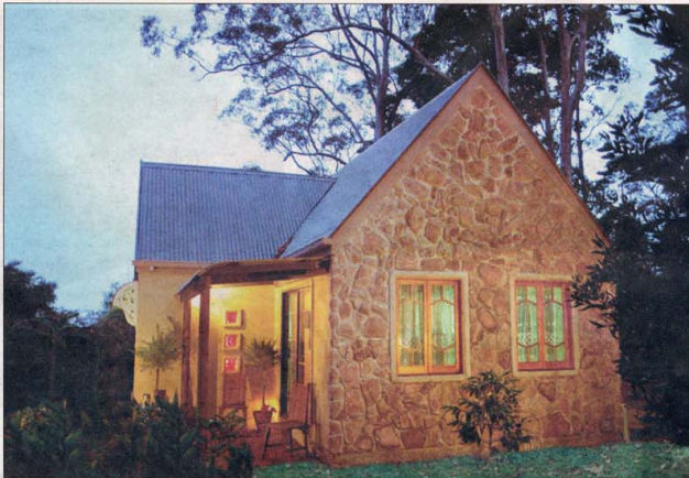
Mountain escape: Witches Falls Cottages offer a world of relaxation far from city cares